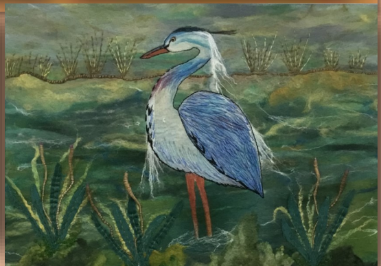
'Artisans in Autumn' ... so much to see and enjoy!