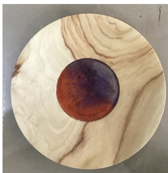
* Plates and platters featuring coloured resins and dyes by John Ragless